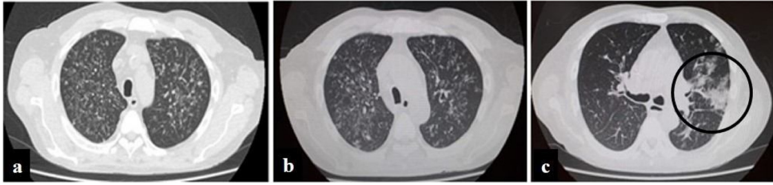
Figure 2 Evolution of chest computed tomography images. Multiple bilateral centrilobular opacities, with tree-in-bud pattern during first hospitalization. Slight increase of multiple bilateral centrilobular opacities during second hospitalization. Follow-up CT image obtained 10 days later of the third hospitalization shows multifocal peripheral abnormalities (circle) with ground glass pattern involve right lung.