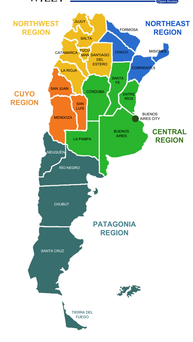
FIGURE 1 Economic regions and provinces of Argentina

(52%–78%), followed by Amerindian (19%–31%), African (2%–9%), and Asiatic (1%). Although the European genetic imprint is high, it is estimated that most inhabitants do have some Amerindian admixture. (Avena et al., 2012). Additionally, in Argentina inhabit, there were several ethnic minorities such as German, Arab, Polish, Jewish, Armenian, Peruvian, Chilean, Uruguayan, Japanese, Chinese, and Korean.